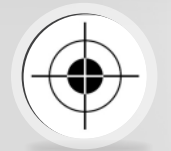
HD Print Quality